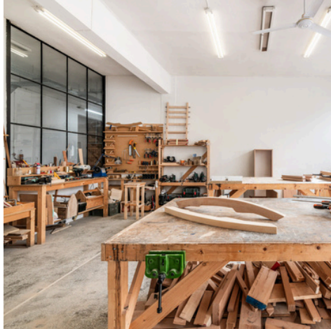
THE WOOD WORKSHOP