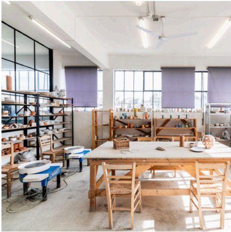
THE POTTERY WORKSHOP