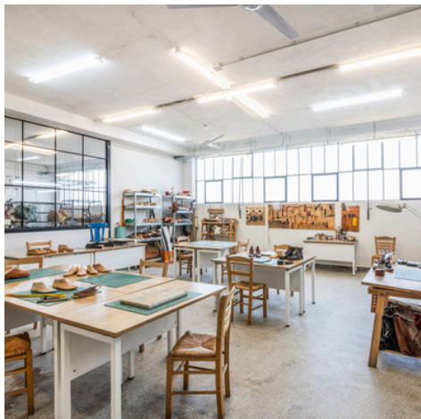
THE SHOEMAKING WORKSHOP