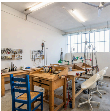
THE JEWELRY WORKSHOP