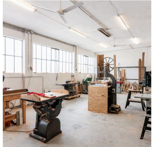
THE WOOD WORKSHOP