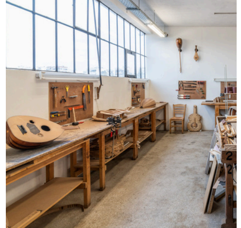
THE INSTRUMENT WORKSHOP