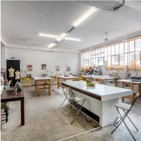
THE TEXTILES WORKSHOP